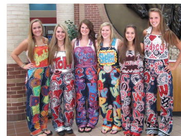
Senior Overalls—a Coppell High School tradition.

Please be sure students are well rested and come to school with several number two pencils as well as a calculator.